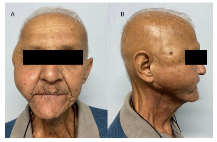
Figure 1. Images of the otoscopic examination of the tumor located in the right jaw region of a 62-year-old male patient. A - Front view. B - Side view. Photos used with the patient's authorization.