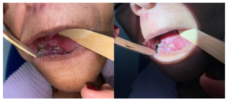
Figure 1. Photograph of the oral examination showing a granulomatous and vegetating lesion in the lower right alveolar ridge region.